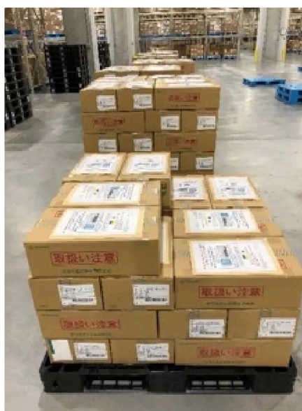
Medicines donated to the Republic of Moldova